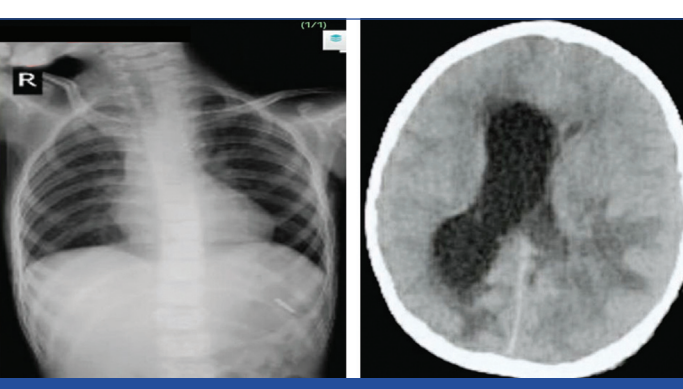
[Table/Fig-2]: Chest X-ray showing mild cardiomegaly (boot shaped heart). [Table/Fig-3]: Magnetic Resonance Imaging (MRI) brain showing cerebral abscess left temporoparietal region. (Images from left to right)

X-ray neck Anteroposterior (AP) and lateral view showed no abnormality, while chest radiograph showed a boot-shaped heart [Table/Fig-2]. Magnetic Resonance Imaging (MRI) brain showed cerebral abscess in left temporoparietal region extending into left ventricle with perilesional oedema [Table/Fig-3].